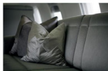
Luxury detailing is included everything from glassware to silverware.