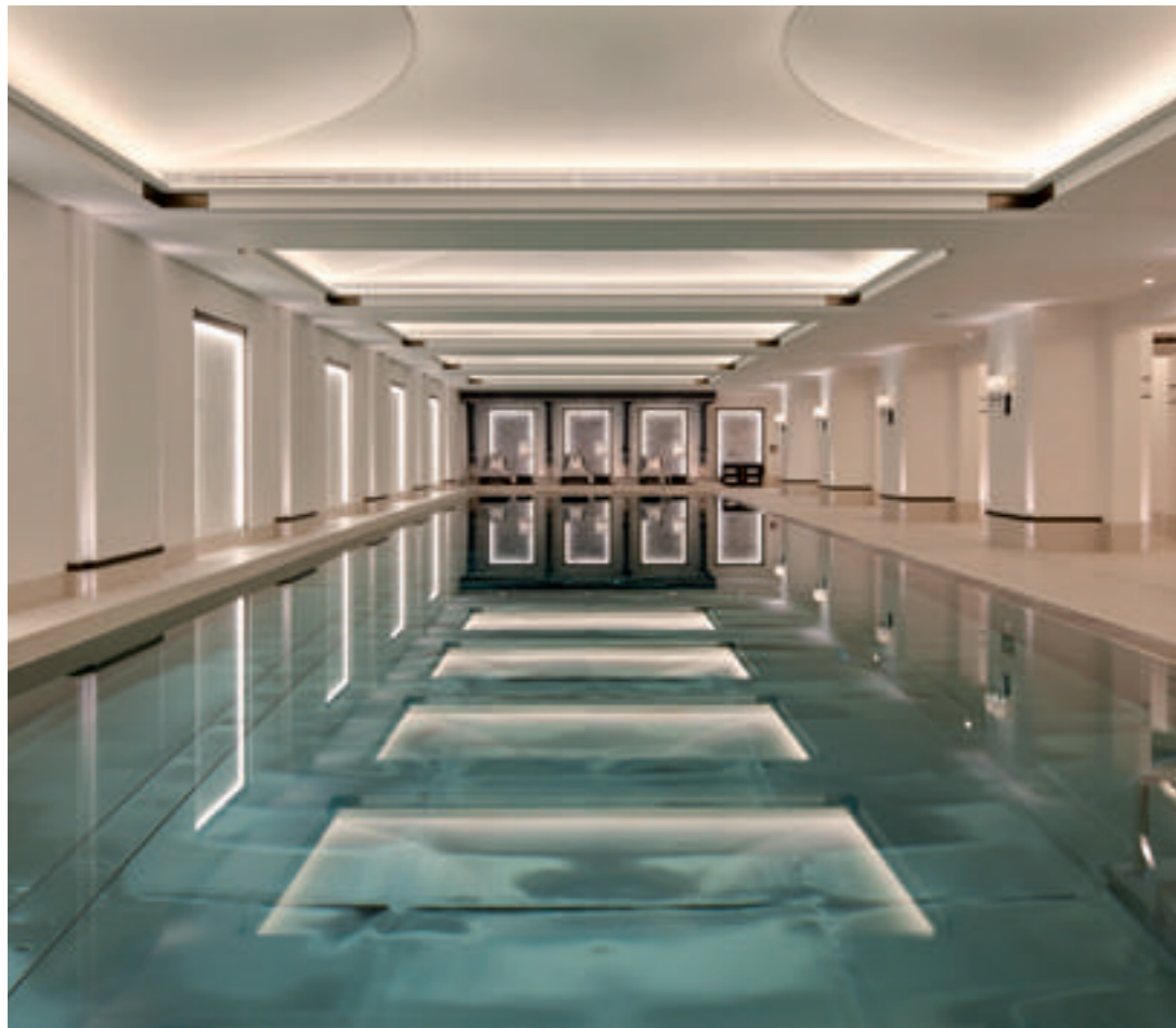
CLOCKWISE FROM LEFT: Swimming pool at Clarges Mayfair; lounge area at Clarges Mayfair; dramatic private apartment in Monaco